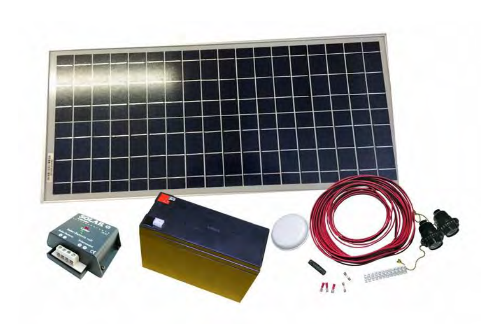
PS-20 DIY 20W full solar photovoltaic pack