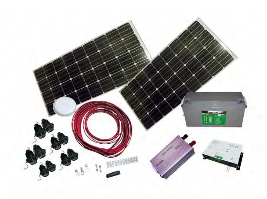
PS-200 DIY 200W full solar photovoltaic pack

Includes 100W solar panel, 65 Amp AGM solar battery, 8A solar charger, 180W 230V/12V converter and an accessories pack for installation.