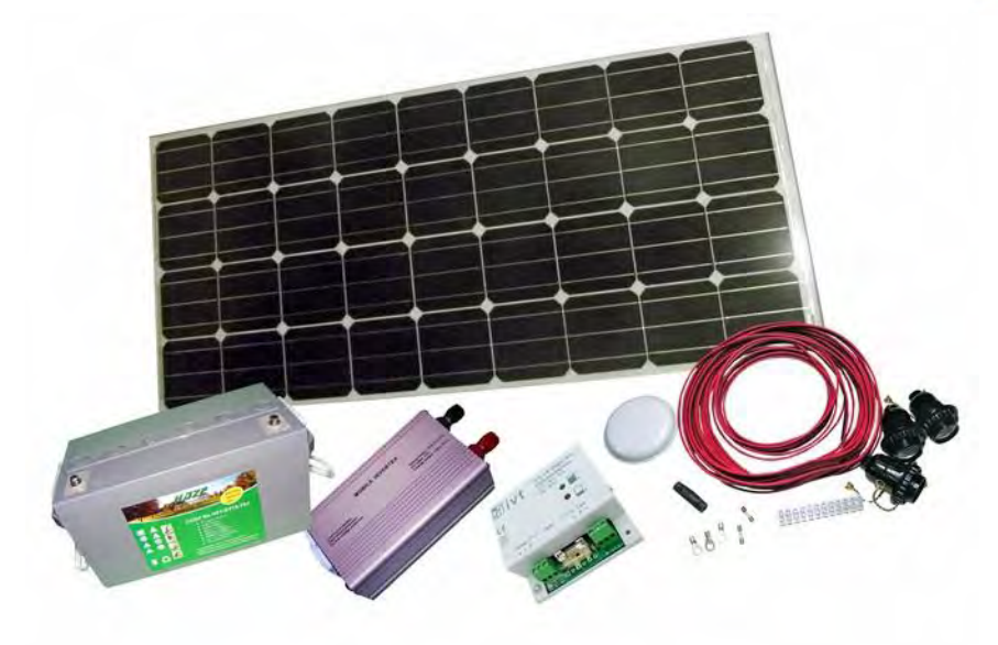
PS-100 DIY 100W full solar photovoltaic pack