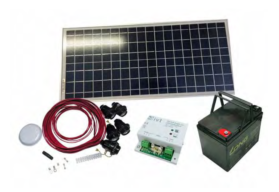
PS-50 DIY 50W full solar photovoltaic pack

Includes 20W solar panel, 7 Amp AGM solar battery, 4A solar charger and an accessories pack for installation.